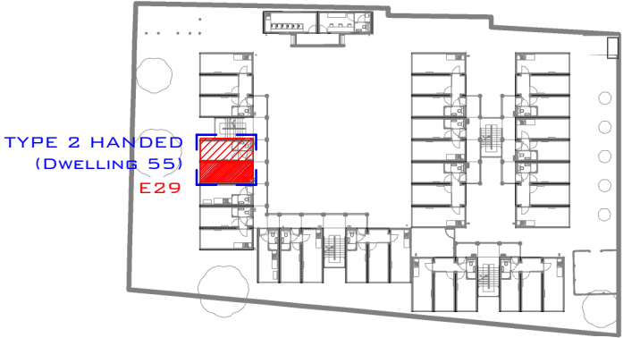
THIRD FLOOR BLOCK E